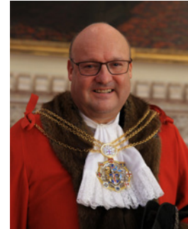
Sheriff Christopher M Hayward CC Sheriff of the City of London Central Criminal Court Old Bailey London EC4M 7EH United Kingdom