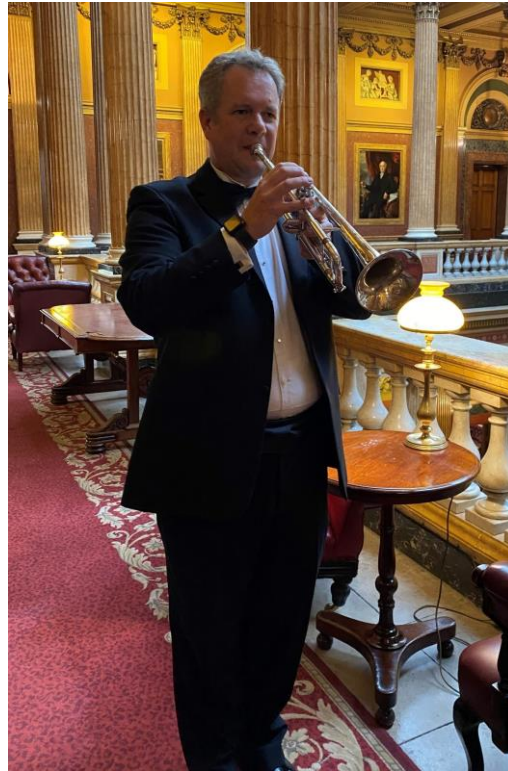
Behind the scenes before the event started

Thank you also to all those Pattenmakers and who contributed so generously to the evening by attending, sponsoring, bidding in the online auction or live on the night and for making donations to the project – I am incredibly grateful.