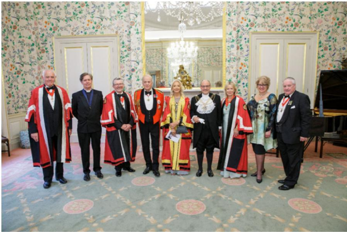
The Renter Warden, Chaplain, Trade Warden, The Speaker, The Master, the Sheriff, Upper Warden, The Sheriff's Consort and Clerk assemble before the Dinner.