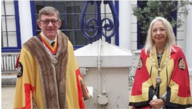
The Master and the Master Wheelwright

We have a very special celebration coming up with the postponed 350th anniversary of the granting of our Royal Charter and we will be joined by the two other companies who share the same anniversary, the Wheelwrights and the Tin Plate Workers. There will be a banquet in Guildhall on 21st September and as places are limited, Liverymen and Freemen and their partner/guest will have first option on tickets at a subsidised price of £100. Additional tickets will then be offered for guests at £125. Book your place now for this historical event Click here to book.