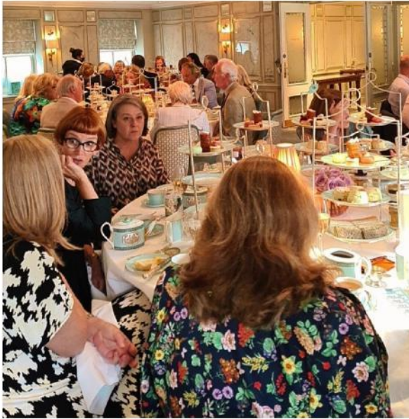
The Private Diamond Jubilee Tea Salon, Fortnum & Mason with Happy Pattenmakers and Guests

The four-course F&M tea was beyond splendid! The beautifully cut crustless sandwiches; fresh scones with jam and cream; and the tiny, wonderfully calorific cakes, specially baked strawberry tarts and Battenbergs were mouth wateringly fabulous. And there was plenty of everything! The guests even took home mini food goodie bags!