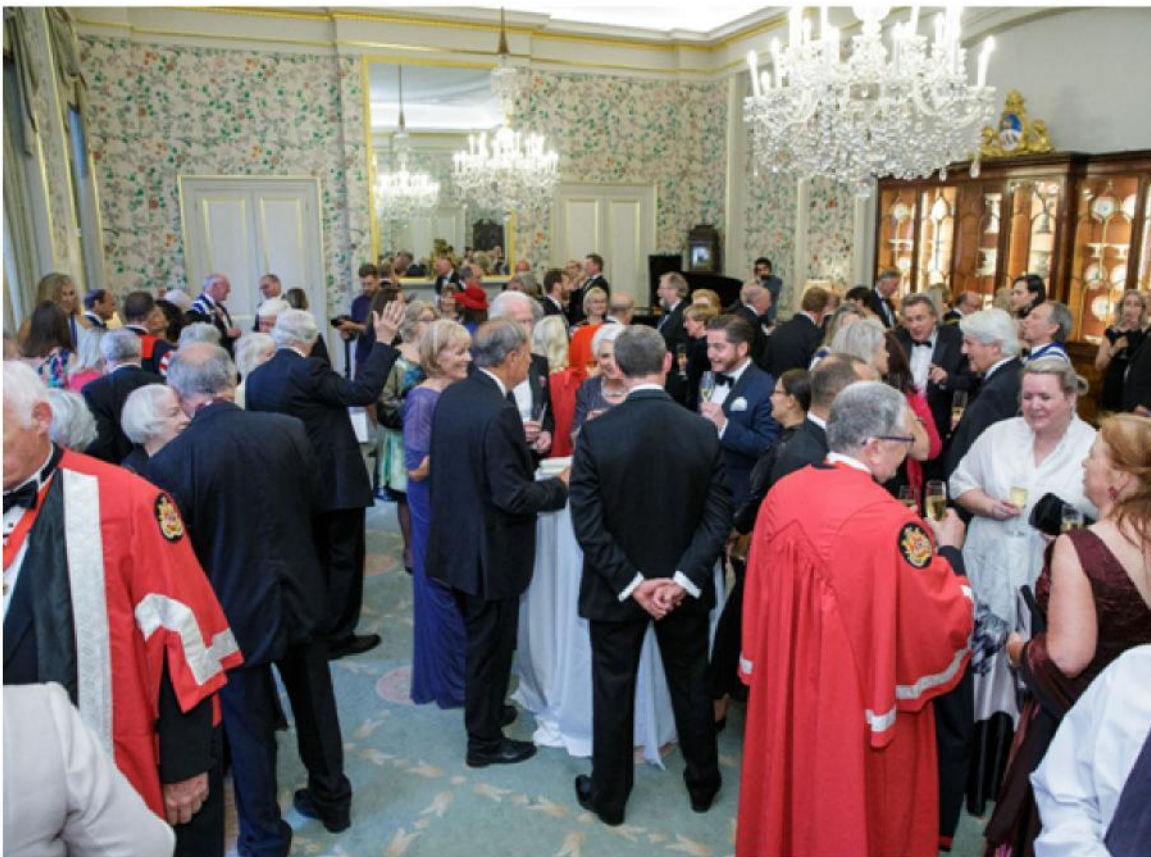
The Pattenmakers and guests enjoy the Reception.