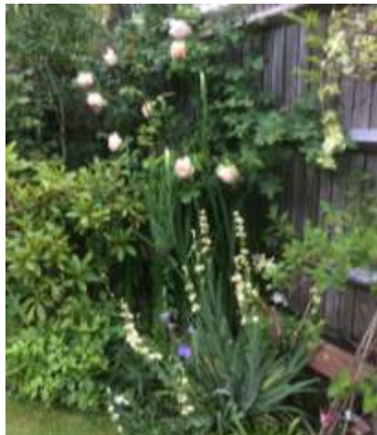
Rose Woollerton Old Hall, Sisyrrinchium, Campanula