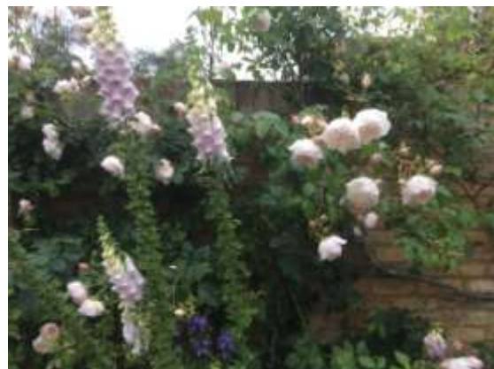
Rose The Generous Gardener, Foxgloves, Campanula