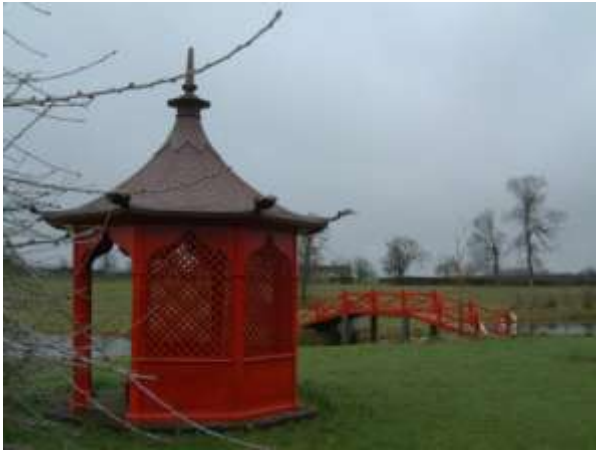
There are woodland areas, terraces and herbaceous borders near the house,