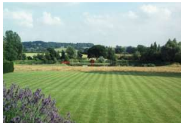
The lake with its Oriental theme lies at the far end of the garden

The house lies in 5 acres (sorry, don't do hectares) of garden which, in true 18 th century manner, 'borrows' scenery from the surrounding countryside.