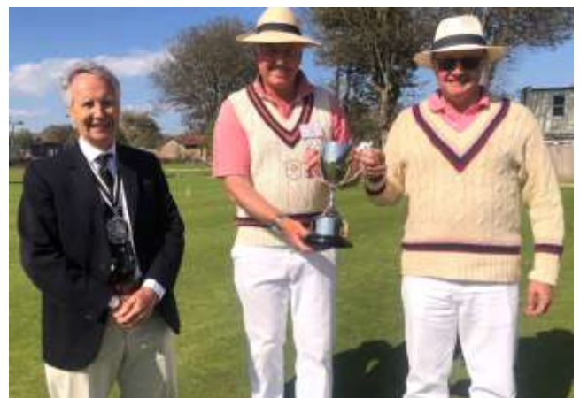
Master Glover presenting the trophy to the Worshipful Company of Leathersellers.

The winners were the Worshipful Company of Leathersellers, followed by the Worshipful Company of Glovers.