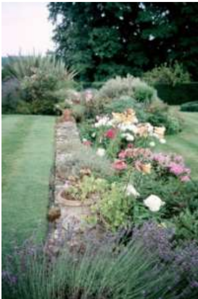
a rose pergola and a 'red' garden (usefully near the kitchen for summer lunches).

And, of course, what country garden could be without its black Labrador – hoping to get into the kitchen while no one's looking and after a cooling dip in the lake.