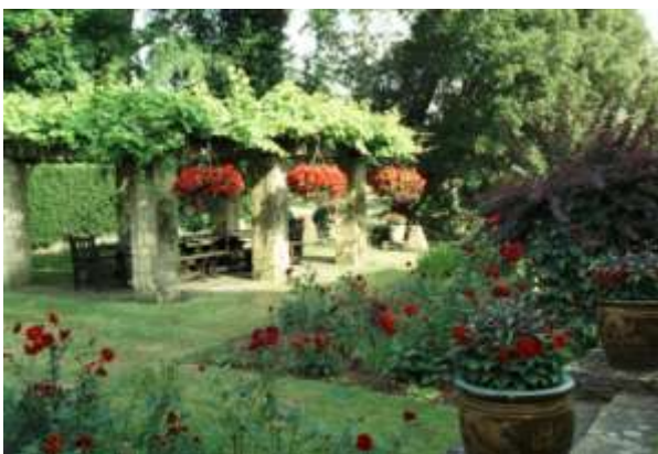
There is also a large and attractive vegetable cum 'cutting' garden

Garden photographs from Twickenham. The roses are certainly enjoying all the rain!