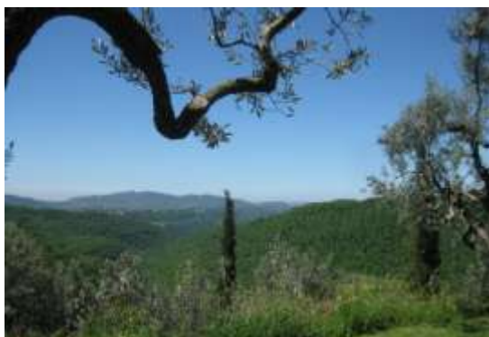
View of the Sabine Hills from the Palazzo Parisi

Once travel returns to our lives, the Palazzo can be rented during the summer months and I'm sure it would be a great holiday (complete with an excellent Italian cook).