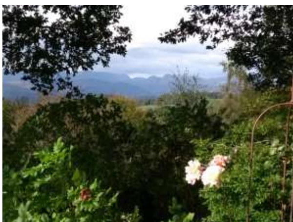
Holehird – Lakeland View

If you are ever around Windermere do visit Holehird Gardens – wonderful views and splendid garden. No matter what time of year it is, this is truly a garden for all seasons which also boasts several national collections – hydrangeas, astilbes and polystichum ferns.