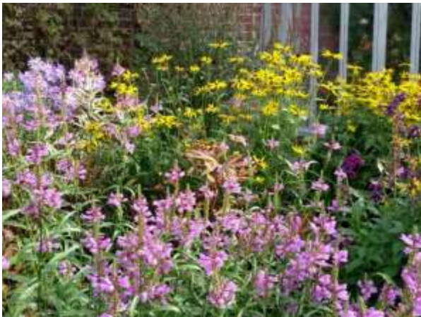
Walled garden late September

handkerchief tree – a Davidia involucreta (there's one in Postman's Park near St Paul's). This tree is named after the 19 th C. French missionary, Pere Armand David. His Order went to China and he was commissioned by the Natural History Museum in Paris to collect plants – he made various expeditions to Inner Mongolia up to the Tibetan border and to the Tsin-ling Mountains in the south-west. In all he found c250 new plant species, many of which were named in his honour, including Clematis armandii and C. davidiana , as well as buddleias, roses and many others.