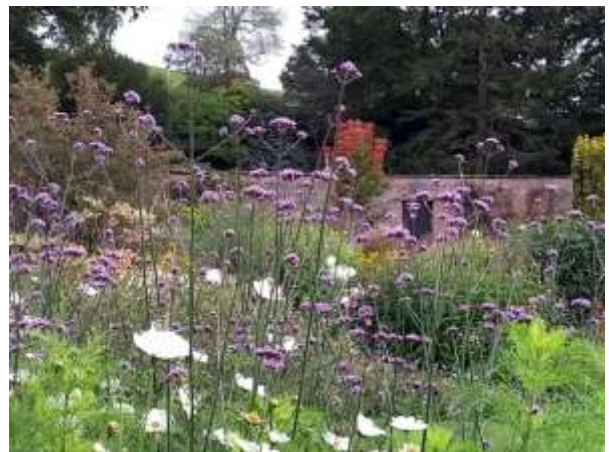
Verbena Bonariensis and Pale Poppies in Central Bed

I visited last autumn (the only time I ventured out of London for the past year) and the flowers in the Walled Garden and tree colours were magnificent. This is probably my favourite part of the garden with its central armillary sundial and sun clock on the wall over one entrance. Depending on the time of year, here you will find the self-clinging vine, Parthenocissus henryana which turns bright red in autumn, several acers, Magnolia 'Caerhays Surprise' (probably bred at Caerhays Castle in Cornwall), the exotic-looking Campsis grandiflora , with its orange trumpet flowers climbing all over the potting shed and even an Australian bottlebrush with its bright red flower spikes, Callistemon rigidus , and many, many more delights.