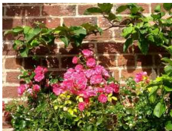
In the walled garden

Driving up to the car park, look to your left you'll see the wonderfully colourful National Collection of Hydrangeas and the Woodland Walk through them, not to forget the views across Windermere to the distant fells. The Hydrangea Walk has over 200 species and cultivars, all the 150 macrophylla cultivars originating from Japan, and look out for the climbing Hydrangea petiolaris in the Walled Garden. Even the walls of the car park are covered with wisteria, clematis and the fascinating Actinidia kolomikta with its tri-coloured leaves of white, pink and green (and which I have tried to grow several times with no success) and not far away is an Alpine House.