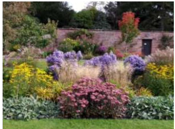
Walled Garden Autumn

I visited last autumn (the only time I ventured out of London for the past year) and the flowers in the Walled Garden and tree colours were magnificent. This is probably my favourite part of the garden with its central armillary sundial and sun clock on the wall over one entrance. Depending on the time of year, here you will find the self-clinging vine, Parthenocissus henryana which turns bright red in autumn, several acers, Magnolia 'Caerhays Surprise' (probably bred at Caerhays Castle in Cornwall), the exotic-looking Campsis grandiflora , with its orange trumpet flowers climbing all over the potting shed and even an Australian bottlebrush with its bright red flower spikes, Callistemon rigidus , and many, many more delights.