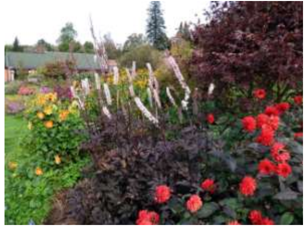
Walled Garden Central Bed