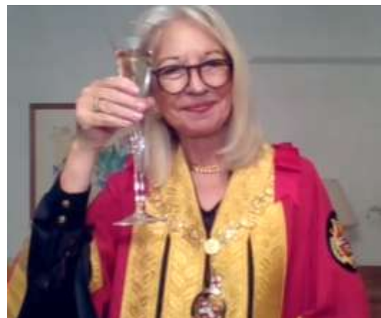
The Master raises a toast to the newly clothed Liverymen.

The ceremony is available to be viewed on the members area of the website in the webinar section.