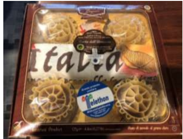
Pasta in the shape of the Rotary Wheel