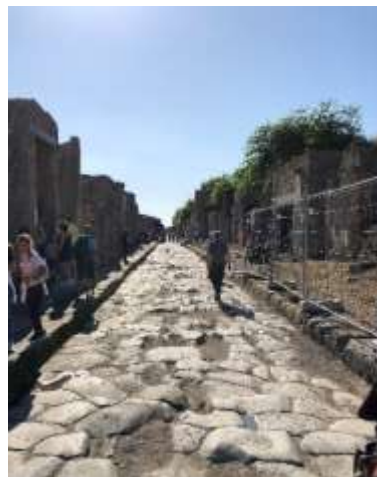
The streets of Pompeii – Pattens would have been helpful to the residents