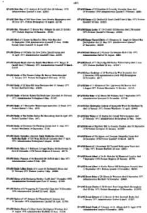
1971 Probate Death Register

some flexibility in what she was known as, since it gives some alternatives and even better that these are documented in this way