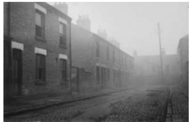
Liggins Street before demolition