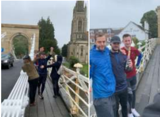
The finishing line