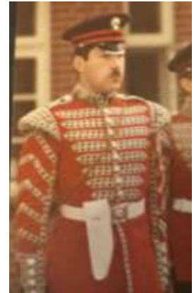
The author serving in HAC as member of Corps of Drums

detachments to the regular army, but that has resulted in at least one death on active service.