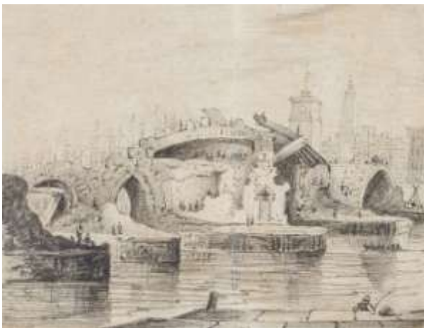
Pencil sketch: "Old London Bridge-sketched on the spot" - during demolition 1832. Sold by Abbott & Holder, August 2019.

Although he did produce watercolours and a few oils, he was best known for his work as an engraver and lithographer. He was also said to be close friends with the watercolourist Thomas Girtin, and also with JMW Turner. He died in Oxford in 1863, at the age of 88.