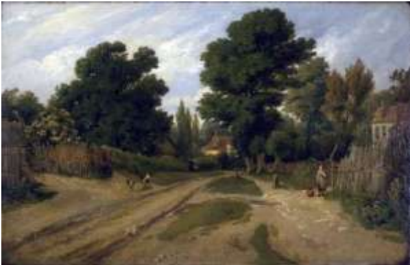
Oil painting: "Waterperry, Oxfordshire" 1803.