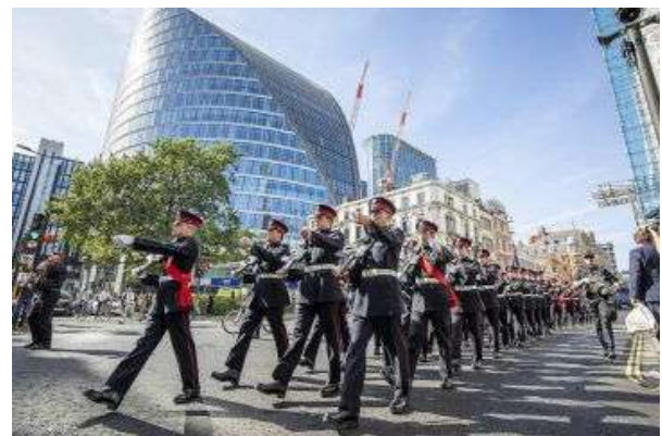
The HAC marching through the City

The Regiment has a long and interesting history and this article can only touch the surface of that, but it is proud of its part in the past present and future defence of this realm.