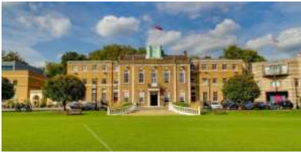
Armoury House, HAC Headquarters

keen to have an instrument of the Crown inside the City walls, but to have it close enough to deal with trouble when needed.