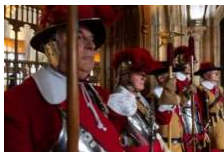
Pikemen and Musketeers

One of the standout moments of each Lord Mayor’s show is seeing the great coach being escorted by the Pikemen and Musketeers of the Honourable Artillery Company, the personal ceremonial bodyguard of the Lord Mayor. In most years there is also a marching detachment and the guns of the regiment taking part. These are all a sign of the close association of the City with that regiment, but I suspect most liverymen know little of its history or customs, so here are my reflections after 16 year’s service and at least 25 as a veteran member.