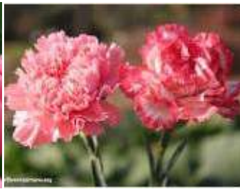
Flower Number 2