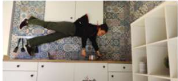
Gravity games are popular here

We've also been enjoying activities that we did not have access to over the past months – from paddle boarding on a lake, concerts, a burger festival and various installations.