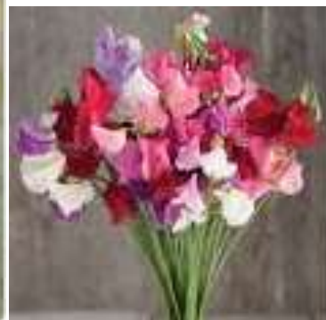
Flower Number 5