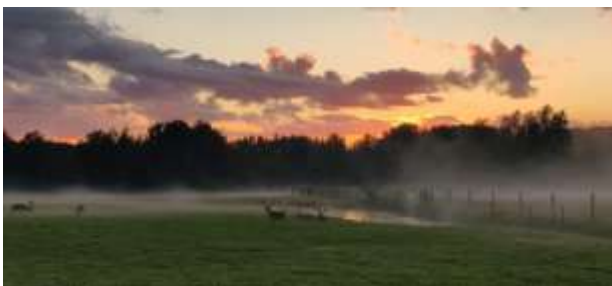
Deer farm and hotel in More, Latvia – view from the hotel and restaurant in the evening You can make very deer friends here, as long as you bring the food

In addition to the architecture and cuisine of Riga, Tallinn and Tartu, as well as the seaside of Paarnu, one of the highlights was spending an evening in a small family-run deer farm hotel, fully fitted with a sauna, a pond to cool in and a ginger cat that chooses its friends by whether you're likely to use a fishing rod