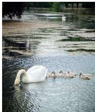
The return of the Bishops Palace swans

As elsewhere, deserted streets were the norm as the usually busy market square in Wells attests (for film buffs...the location of the Hot Fuzz shoot-out). But nature carries on; the widowed swan on the Bishops Palace moat, absent for a year, has returned with her new partner and a ‘herd’ of cygnets (I Googled it!)