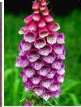
Flower Number 6

Answers please on an email to the Clerk: clerk@pattenmakers.co.uk