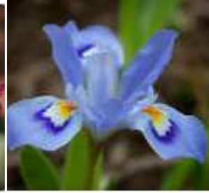
Flower Number 3