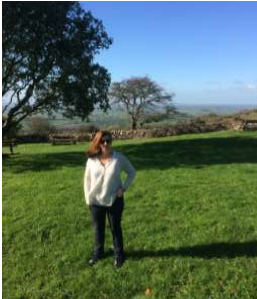
"Another Perfect Day in God's Country" (Hot Fuzz)

diet! The dogs have never had so many walks and, without a commute, it's finally been possible to fit in a decent amount of exercise.