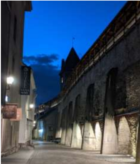
Tallinn old town in the evening – we were told that the city had not seen such low numbers of tourists since the early 1990s.

In addition to the architecture and cuisine of Riga, Tallinn and Tartu, as well as the seaside of Paarnu, one of the highlights was spending an evening in a small family-run deer farm hotel, fully fitted with a sauna, a pond to cool in and a ginger cat that chooses its friends by whether you're likely to use a fishing rod