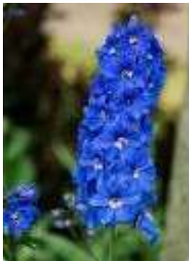
Flower Number 4