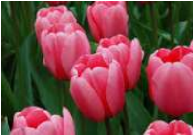
Flower Number 1