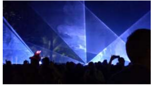
Evening laser show in the castle courtyard

We also explored the broader region. The Baltic countries (Lithuania, Latvia and Estonia) have always been tightly knit. As we travelled through Latvia and Estonia, we encountered large numbers of Lithuanians, Finns, Latvians and Estonians exploring what their own and neighbouring countries have to offer.