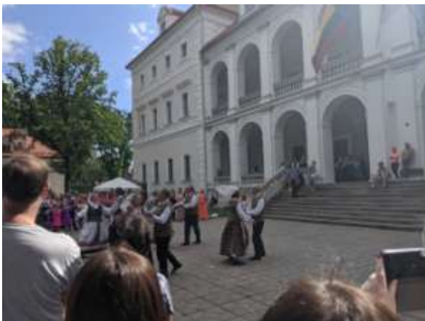
Birzai amateur dancers show off their skills