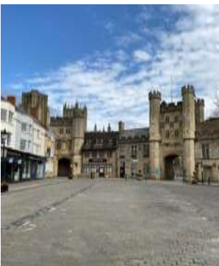
Deserted Market Square in Wells

Lockdown itself was an almost unique experience combining perfect weather with the near-silence brought on by empty roads and empty skies. Despite living in this house for fifteen years, it was only in this enforced stillness that I discovered that a tawny owl uses the tall Scots pine adjacent to the house as its hunting perch...vigilant at dusk before gliding silently into the neighbouring field to hunt.