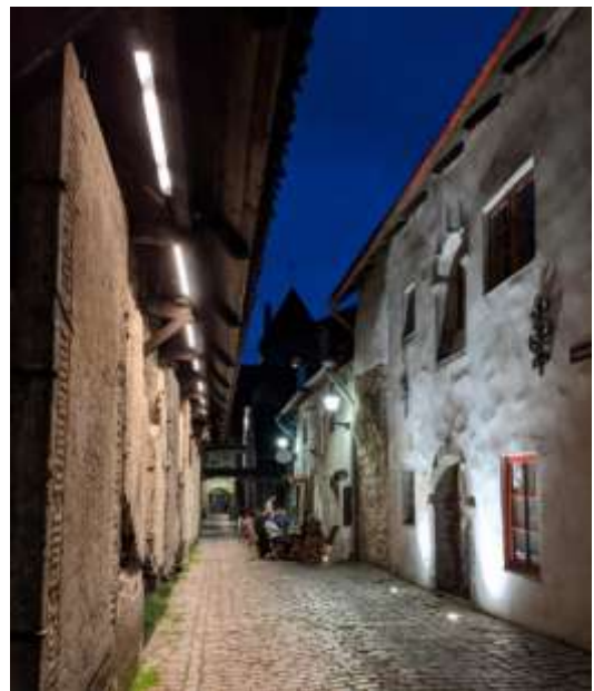
Tallinn old town restaurant