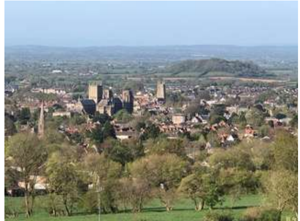
From a distance everything looks normal

As elsewhere, deserted streets were the norm as the usually busy market square in Wells attests (for film buffs...the location of the Hot Fuzz shoot-out). But nature carries on; the widowed swan on the Bishops Palace moat, absent for a year, has returned with her new partner and a ‘herd’ of cygnets (I Googled it!)