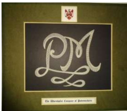
Gift to the Pattenmakers

This framed piece is now housed in The Guild Church of St Margaret Pattens. Up my stairs to the first floor, I now have a gallery of Buck's Point pieces. In my dining area, there is a display of Milanese, and in the sitting room, Bedfordshire. I