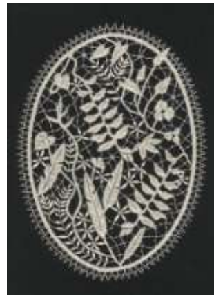
Thailand Inspired Lace