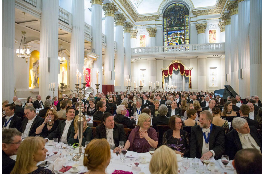
Members and guests enjoy the Annual Banquet in January 2018