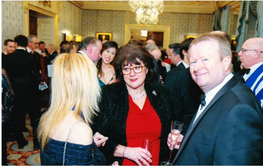
Guests enjoy pre-dinner reception drinks.